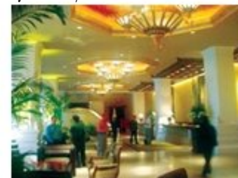
Plaza Hotel Lobby

Thursday January 24th CHIANG MAI- MAE HONG SON