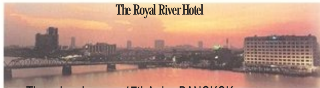
The Royal River Hotel